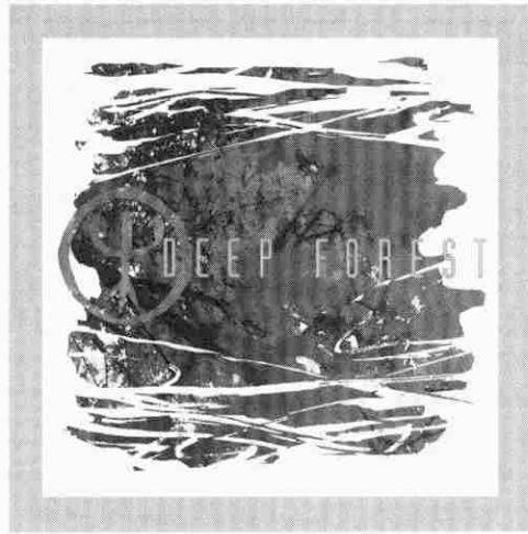
Figure 3 The “maybe . . . your future” of primitive and spiritual modernism

The second reference here is to Simha Arom, another CNRS ethnomusicologist, whose recordings of Central African pygmy music are sampled on many of Deep Forest 's tracks. In fact much of the music on Deep Forest involves pygmy references, and the theme of the African rain forest and its peoples is announced strongly in the CD's music and packaging. Indeed, the introductory song, also titled “Deep Forest,” begins with a very deep and resonant voice that announces (in English): “Somewhere deep in the jungle are living some little men and women. They are your past. Maybe they are your future.”