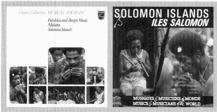
Figures 4 and 5 Rorogwela's ethnomusicological aura