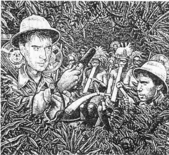
On a search for new musical inspiration, David Byrne unexpectedly runs into Paul Simon.

Into and through the 1990s, pop star curation continued to lead the marketplace expansion of world music. But in each case distinct models of the inspiration and collaboration mix also emerged, revealing more of the political and aes-