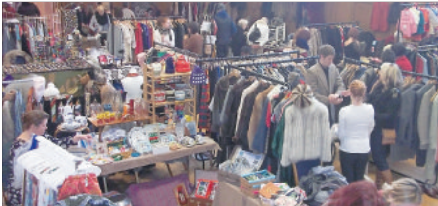
■ The vintage fair will return to the Assembly Hall on Sunday