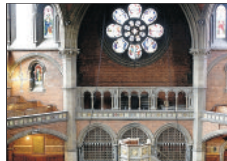
■ The Union Chapel congregation are 'thrilled' at the grant

Now, its future is secure thanks to £470,000 from the Heritage Lottery Fund (HLF) which will be used to repair the machinery, pipework and enclosure.