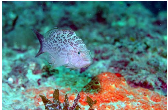
Scamp Grouper

Sex change is affected by ambient factors and fishing pressure in some cases. Benton and Berlinsky (2006) conducted a lab study manipulating the ratio of females to males in black sea bass ( Centropristis striata ). They showed that sex change is, at least in part, triggered by social structure or sex ratios. A similar effect has been found in wild populations of other fish species (Table 1).