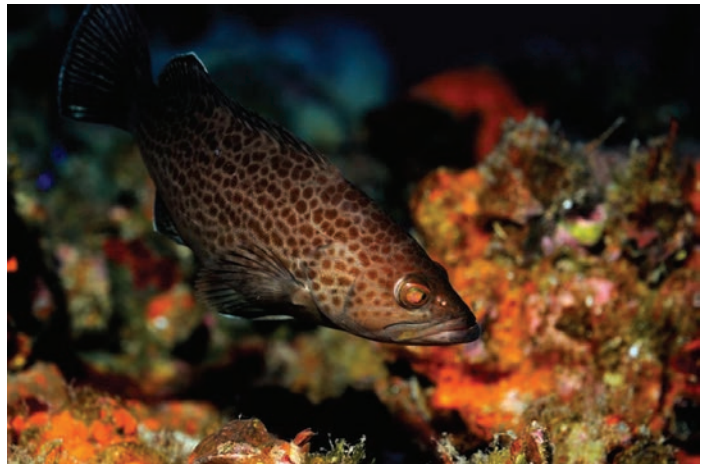
Scamp Grouper

With territoriality, there are multiple strategies for reproductive success. The primary male is aggressive, has high androgen levels and small testes. The secondary male (a.k.a. sneakers, streakers, and satellite males) is not aggressive, has low androgen levels and has large testes producing large quantities of sperm. These tend to also be the characteristics of group spawners. Wingfield (1984) and Wingfield et al. (1990) explained that with territoriality comes aggression and mate competition. He proposed “The Challenge Hypothesis” where competitive interactions are key to reinforcing the reproductive success of the dominant male. An environmental input starts the cycle for reproduction but intra-specific aggressive