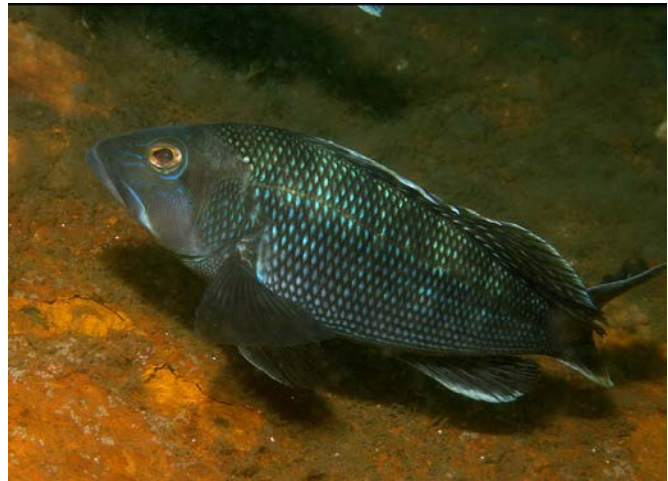
Black Sea Bass

Although hermaphroditism is more prevalent in some taxa than others, the expression of hermaphroditism varies considerably between species even within the same family. For example, some parrotfish (Scaridae) form harems