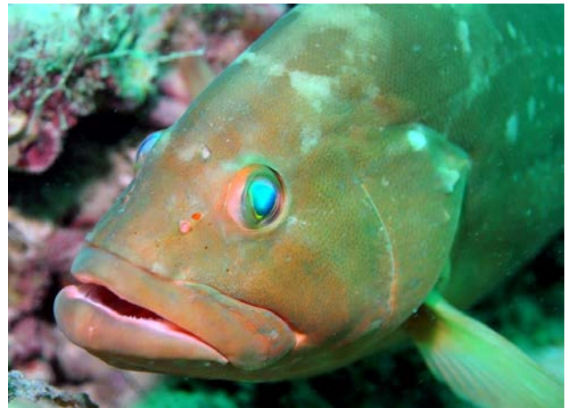
Red Grouper

In addition to relative abundance data, MARMAP/SEAMAP-SA/SEFIS provide life-history information such as species identification (morphological characteristics), fish length and weight, age and growth information, reproductive data, diet composition, and data from various other tissue samples. Whole and sectioned otoliths and spines are processed to provide species-specific information on age and growth. The survey supplies fish gonad samples to examine reproductive data by processing and examining samples using histology or other techniques. The collection of fish samples provides data for length-weight relationships, length and age compositions, length at age, growth parameters, maximum age, sex ratios, length and age at maturity and sex transition, and other information.