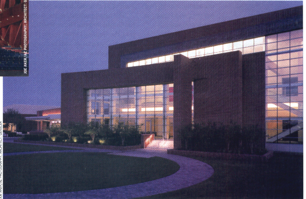
ARCHITECT: GENSLER