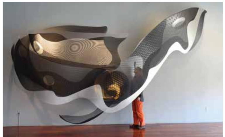
Navigation , 2012 perforated metal, paint, light, 11' x 19' x 6'