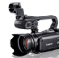
Canon Vixia XA10

Web video is exploding in popularity, with over 800 million unique visitors watching over 4-billion hours of video each month on YouTube alone! And with more agencies and organizations participating in social media spaces like Facebook and Twitter, it's important to realize that videos get more clicks and "shares" from users