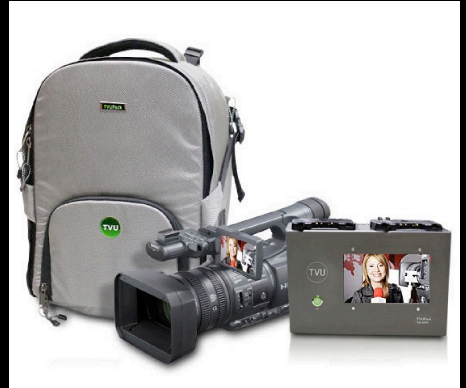
TVu Broadband Backpack