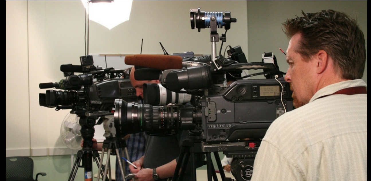
Sacramento County Public Health news conference - H1N1