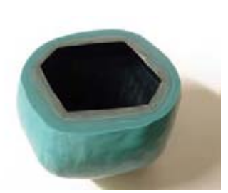
Study O Portable - Fuzz