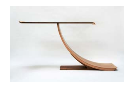
Simon Yates - Grace