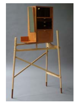
David Gates - Dressing stand