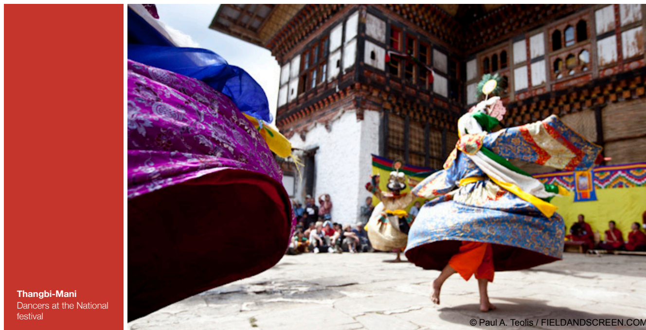
Thangbi-Mani Dancers at the National festival