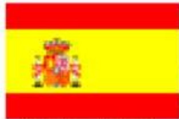
Spain, the mother country