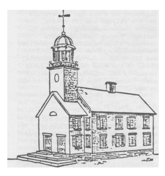
The Baptist Church Granville, Ohio 1831