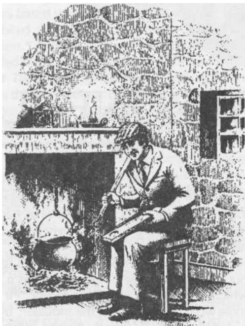
Starting a spoon with a "Twca Cam."

When young men in the 17th century started to develop a more stylish type of love spoon, which had no domestic purpose but only was used as a symbol of love and as an ornament, there seemed to be no limit to the