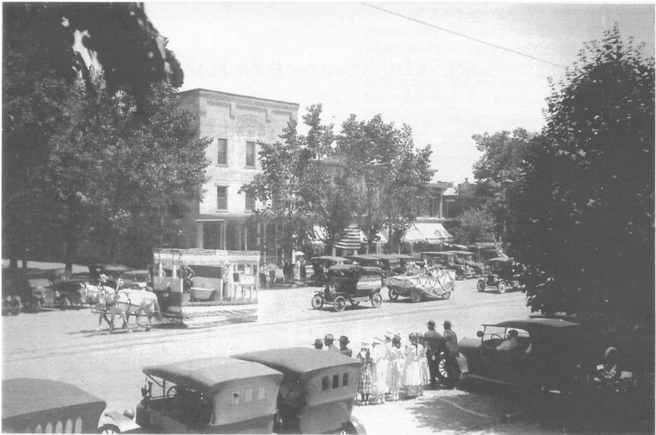
The Parade, July 4, 1915

The fact that the celebration had been in the making for weeks and that it had been thoroughly advertised had the effect of bringing to Granville one of the largest crowds of people that ever gathered here for any previous Fourth of July celebration, and the occasion proved more of a success than even the most optimistic of its promoters had anticipated.