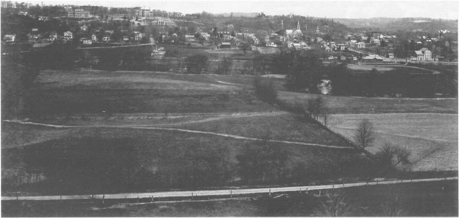
Granville from Flower Pot Hill, south of town, about 1910