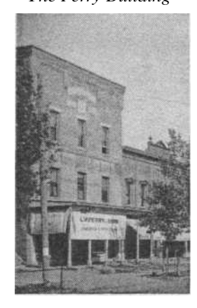
The Perry Building

Consequently, the Society folded up and their possessions were stored in a frame structure that had been moved to the Denison Campus in 1855. The building was erected to