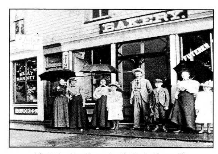
Shopping for Groceries in Early Granville

In 1805, there were plenty of wild turkeys in town. People spoke of seeing flocks that were as large as 100-500 turkeys, and at times the birds had to be chased away to let the wheat grow Burg Street was seen covered by turkeys. Turkey breast was taken out to be smoked and dried for "jerks": most of the rest of the turkey was thrown away. Mrs. Minchell. an early settler and a grandmother of Ellen Hayes, found a wounded 22-pound turkey and served it! The birds could be trapped with corn kernels and then be shot for food. One turkey weighed 38 pounds.