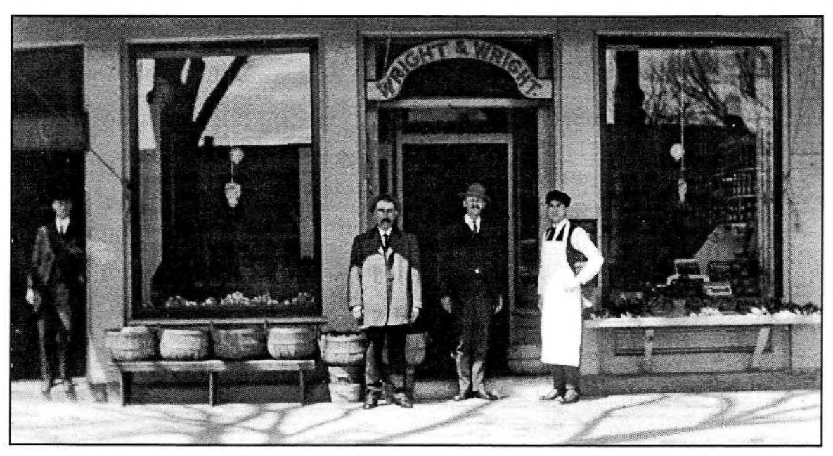
The Wright & Wright Grocery in Granville, Ohio

Lunch and dinner were similar meals as the settlers used their most abundant food. Corn was ground and often used for hominy There were such luxuries as ribs and dried wild grapes or cherries. In season, blackberries. mulberries, and elderberries were eaten as well as cranberries brought to the settlers by the Indians. They did not yet have baking powder or tin ware, and cooking was done over coals in the fireplace of the main room.