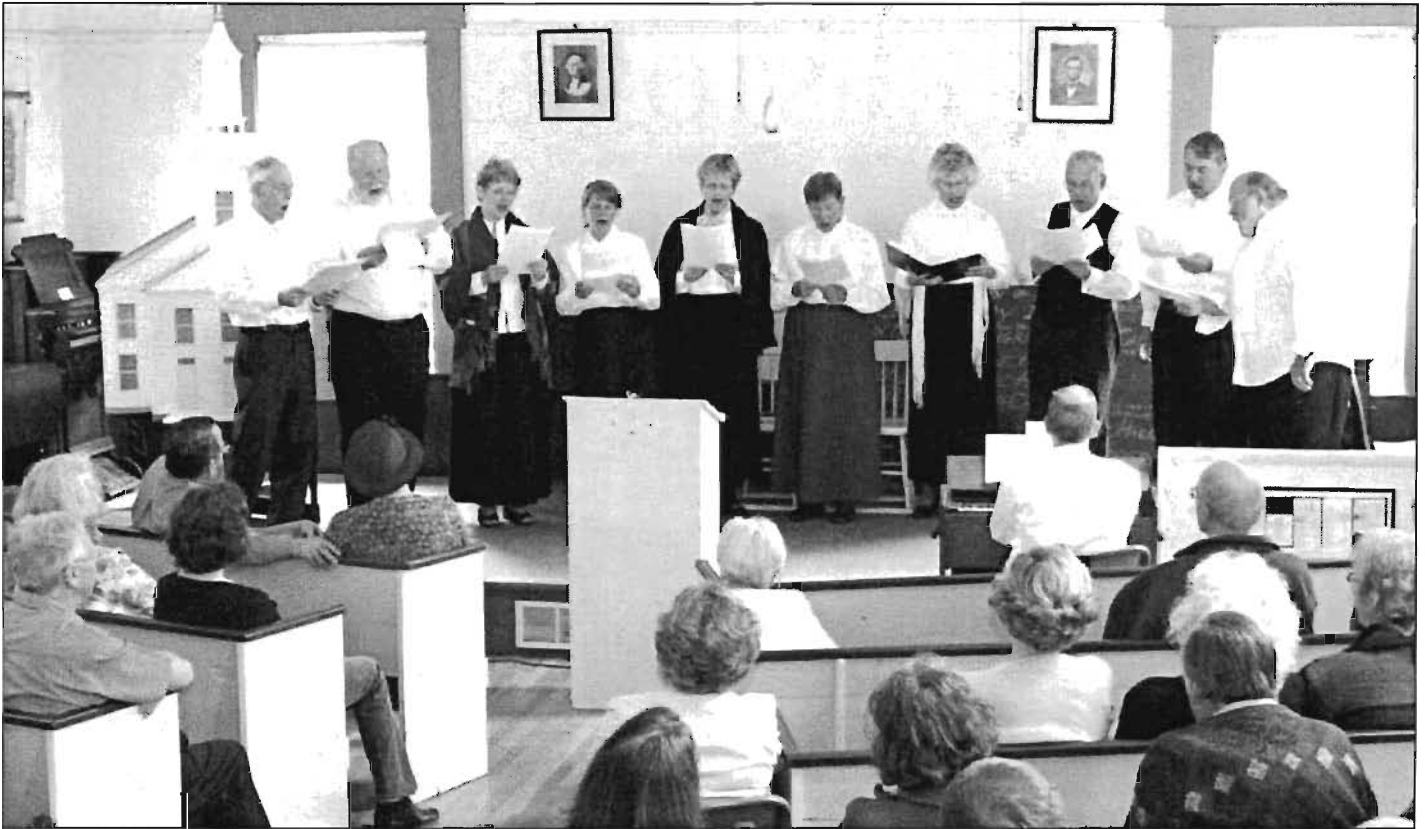
The Temperettes, a Temperance chorus, performed to help maintain the spirit of the meeting.

alone, but for their country's weal and for future generations who were yet to descend through their loins.