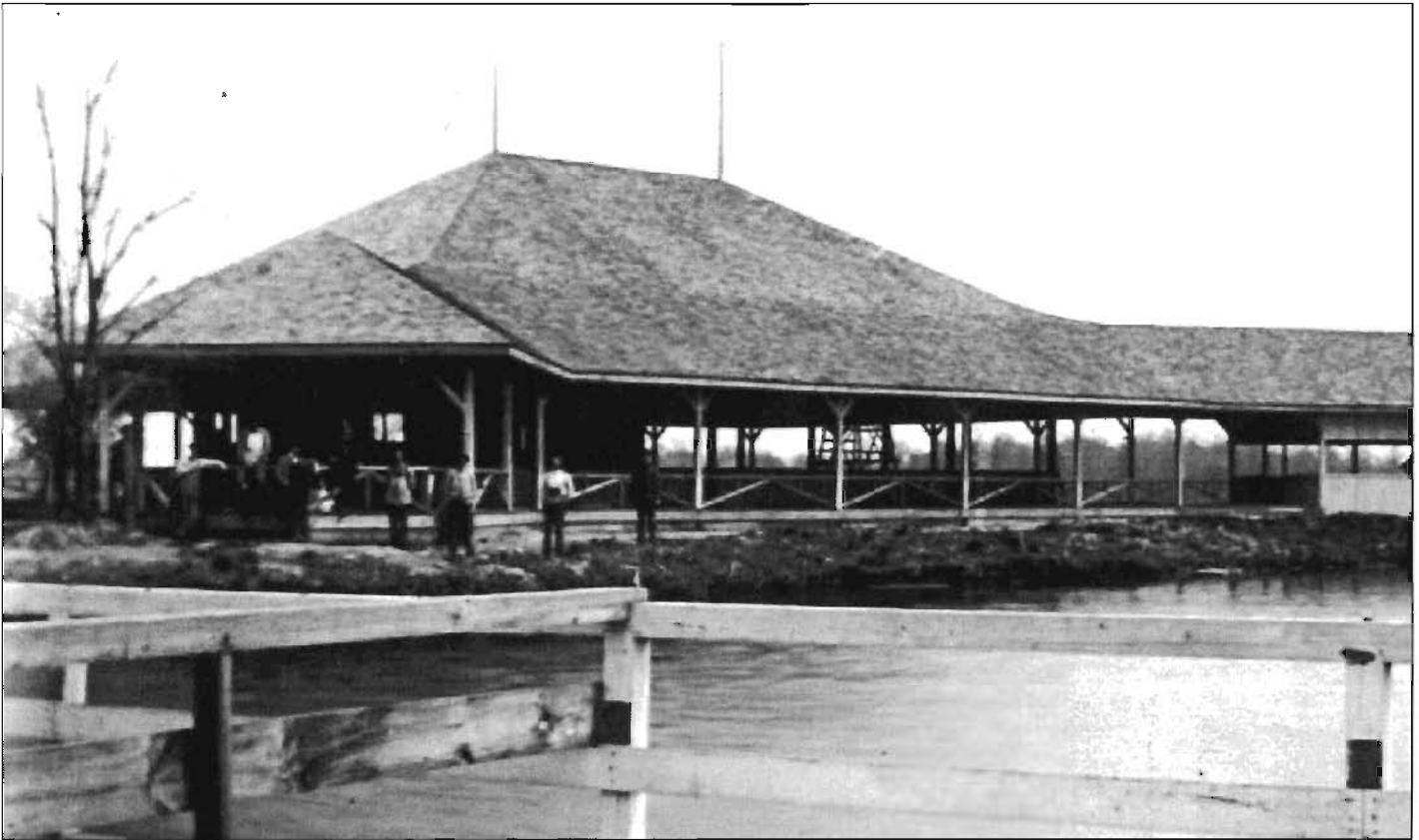
A turn-of-the-century fish camp at Buckeye Lake.