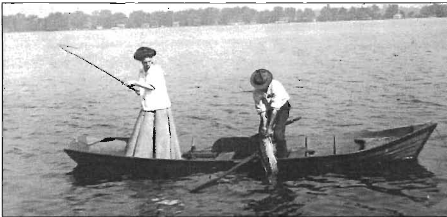
A Granville couple fishes on Buckeye Lake.

The centennial history is available at the Denison University Bookstore and at the Buckeye Lake Yacht Club, Wednesday through Sunday.