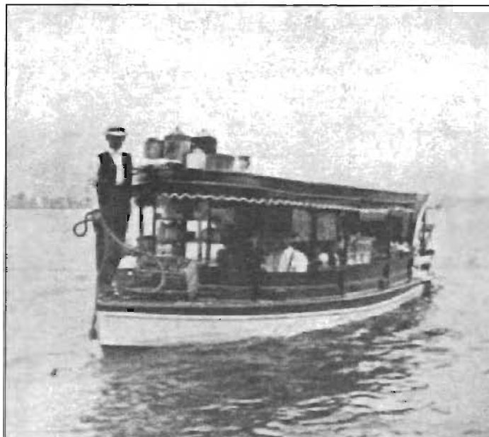
A Buckeye Lake grocery boat such as the one pictured above brought a complete stock of groceries, fruits and vegetables to the docks of Buckeye Lake residents three days a week. This photo appeared on an advertisement for Bendum and Peters of Millersport.

Since thirty years earlier, when the first railroad came to the reservoir bringing in ever increasing numbers of anglers, fishing in it had grown steadily worse. And with arrival of the electric interurban, just three years before, such deterioration had increased rapidly until the waters were well nigh fished out. Now, perhaps, this trend would be reversed. But there still remained one, big, pesky fly in these diehards' conjured up molasses. Twelve years before, in 1894, the state legislature had "reserved Licking Reservoir" as a public park to be known as "Buckeye Lake." Such action, however, had not made it a "Lake." It still remained substantially unaltered and potentially as much a fisherman's haven as ever before. About all that the lawmakers had accomplished was to legalize and encourage the reservoir's encroachment and depredation by ever increasing numbers of unsympathetic people and boats. Even talk of efforts to make a lake of this body of water was disturbing to the "sot" of the graybeards' ways. They admitted no net advantage in minor so-called improvements that had been made.