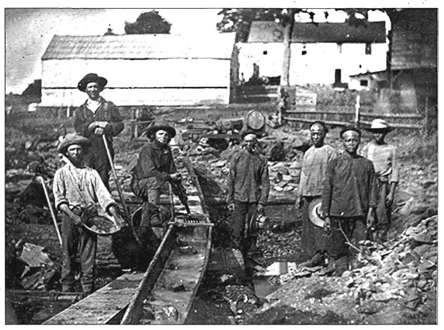
Panning for gold in California. (Identities of these men are unknown.)