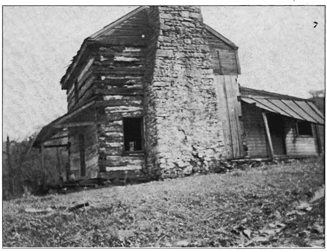
A cabin in Granville, Ohio's Welsh Hills.

Although the full explanation for the abandonment of Beulah for the military lands in Ohio is unclear, in August of 1801 three members of the community went to examine the new tract. Rees purchased approximately 1,000 acres from Samson Davis on Sept. 4, 1801. Others purchased nearly 2,000 additional acres. Over the next few years, families continued to arrive in the Welsh Hills mostly from the Beulah community, but also from Oneida County in