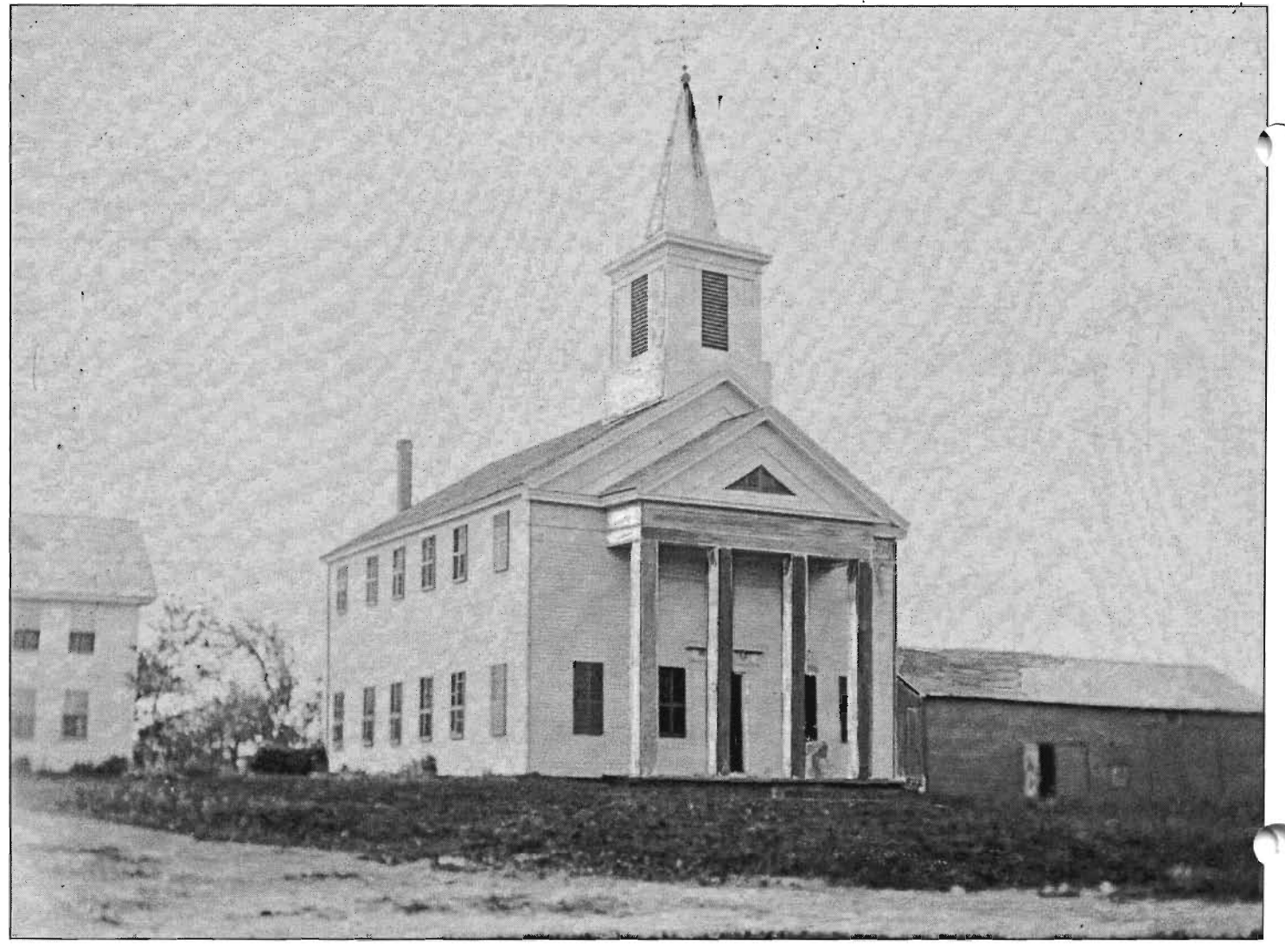
The is the "mother church," the Congregational Church in Granville, Mass., which many of Granville, Ohio's settlers attended before their move west.