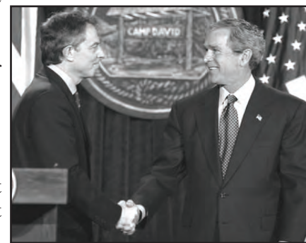
President George Bush and Prime Minister Blair

In similar fashion, most of us don't understand why the hostility exists between the Jews and Arabs. Why so much anger, animosity, and hatred between these cultures, including the United States and Britain? At the risk of, but not intending to oversimplify the incredibly complex issues of our current Middle East problem, fundamentally, if you understand the family