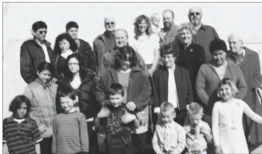
Acme, Alberta Congregation