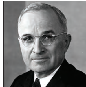
Harry S. Truman

However, conversely there were others who deeply respected President Truman and thought he was very intelligent because he was so well read in classical literature and the Bible. Frankly, if the truth were known, he was probably “brighter” than many of his peers. But clearly, his conviction that God was directly involved in his life was something he was at peace with, and is probably why he calmly concluded he was, in fact, a “modern-day Cyrus.” He publicly announced this in 1953 before a group of Jewish dignitaries at the Jewish Theological Seminary of New York.