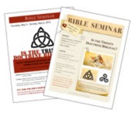
Camp Meeting Flyers

who came and shared the blessings with us, and to our speakers who brought such timely messages.