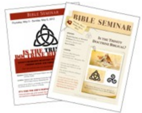
Camp Meeting Flyers

who came and shared the blessings with us, and to our speakers who brought such timely messages.