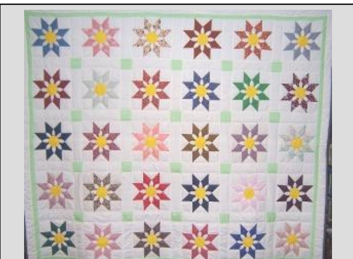
2007 Piece Corp Quilt—tickets $5 ea or 3 for $10