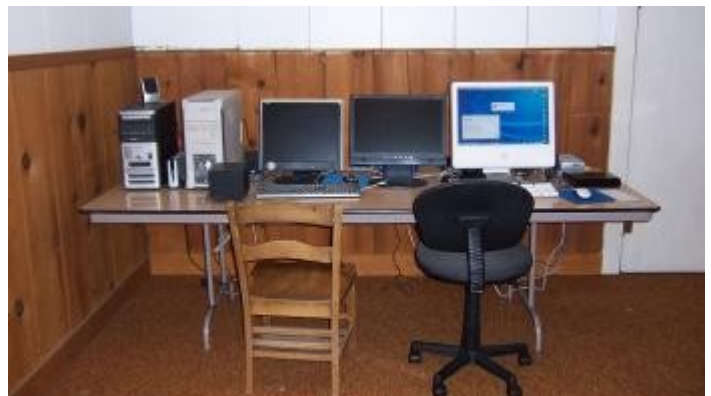
The new home for the Internet ministries of HollywoodJesus.Com and OutSideTheWalls.Com