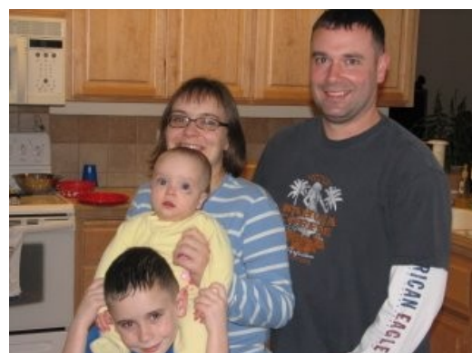
Wilson Family from Klamath Falls