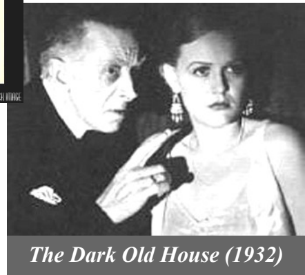
The Dark Old House (1932)

First movie starts promptly at 6:30 p.m.