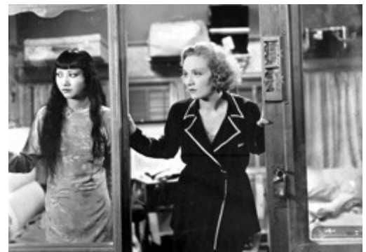
Anna May Wong and Marlene Dietrich in Shanghai Express

Snack bar opens at 6:00 p.m. First movie starts promptly at 6:30 p.m.