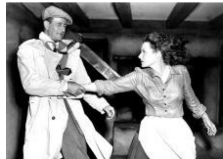
John Wayne and Maureen O'Hara in The Quiet Man

Plus the usual extras and surprises. Join us for the fun!