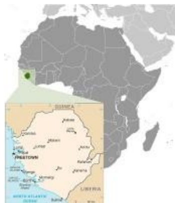
Sierra Leone, Africa