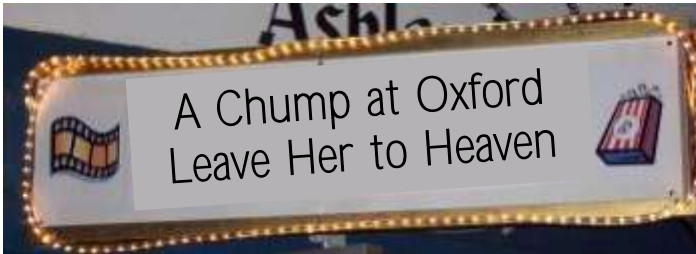
OLD TIME MOVIE NIGHT-- LOADS OF LAUGHS AND AN ICY LOVER