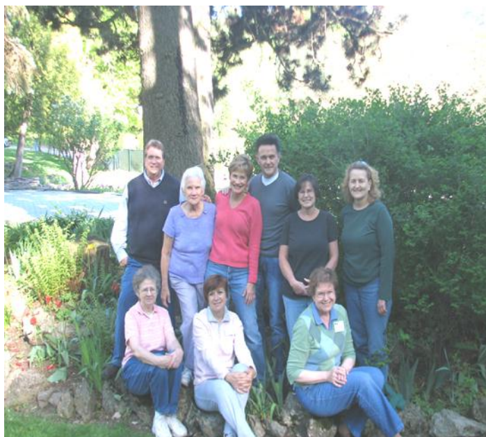
The kitchen team at Haus Edelweiss during Session 2 2010.

There are several answers to this question. There is a great deal of satisfaction derived from being fer-