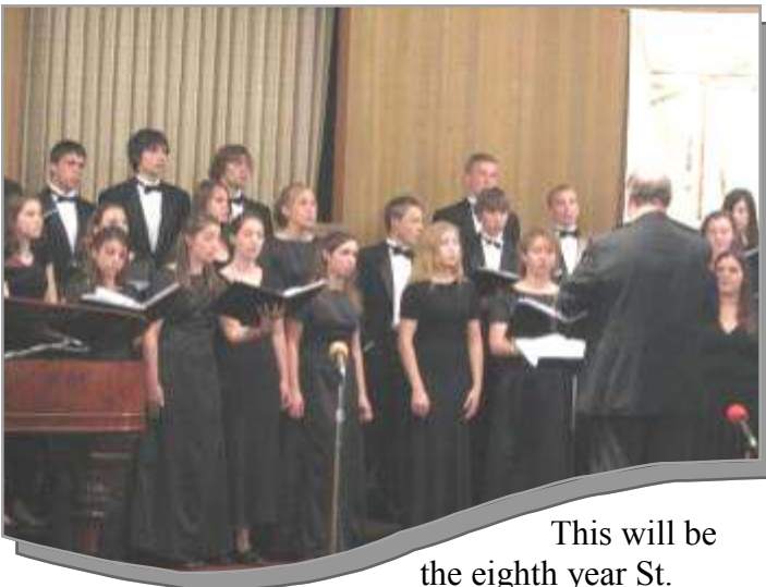
This will be the eighth year St.

Every year at this time we gather to elect new or returning church leaders. This year we will also consider a revision of our by-laws to permit more flexibility in scheduling future annual meetings of the congregation. Finally, recent highlights of activities, projects and a sneak preview of future directions will wrap up the agenda. Show up late for the 6:30 gathering and you may miss it all. Then we move from the Fellowship Hall to the Sanctuary.