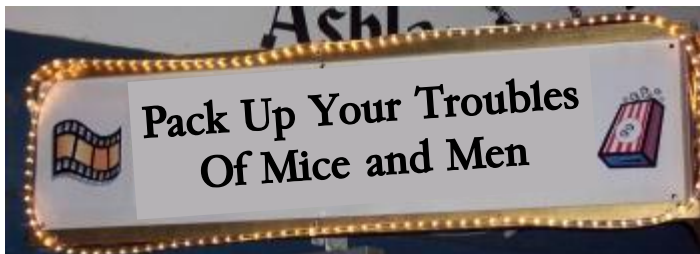
GAWRSH...A NIGHT OF APRIL FOOLS!