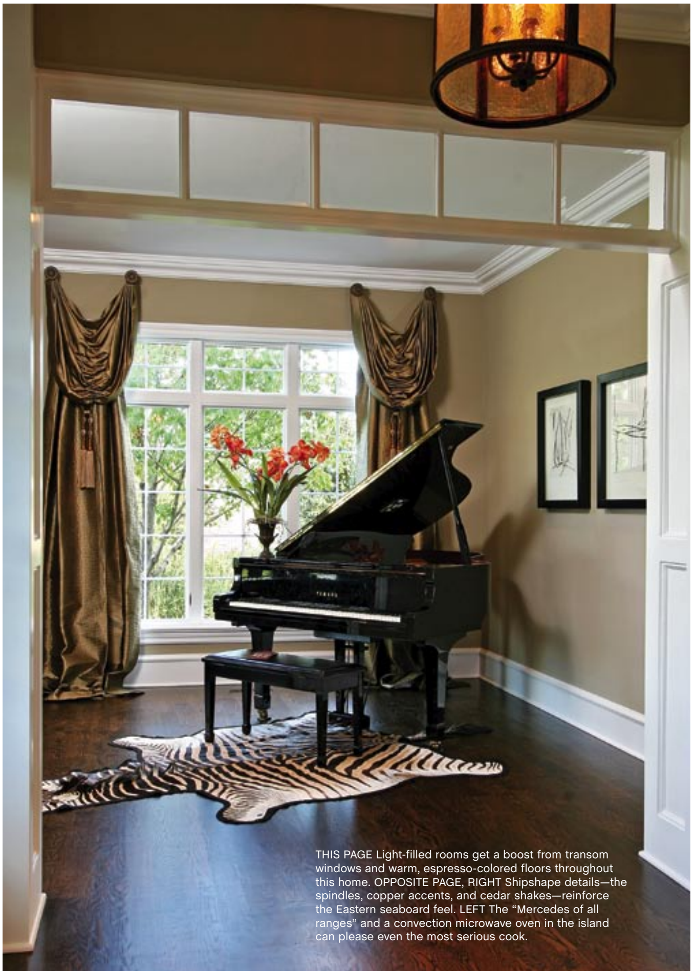
THIS PAGE Light-filled rooms get a boost from transom windows and warm, espresso-colored floors throughout this home. OPPOSITE PAGE, RIGHT Shipshape details—the spindles, copper accents, and cedar shakes—reinforce the Eastern seaboard feel. LEFT The “Mercedes of all ranges” and a convection microwave oven in the island can please even the most serious cook.