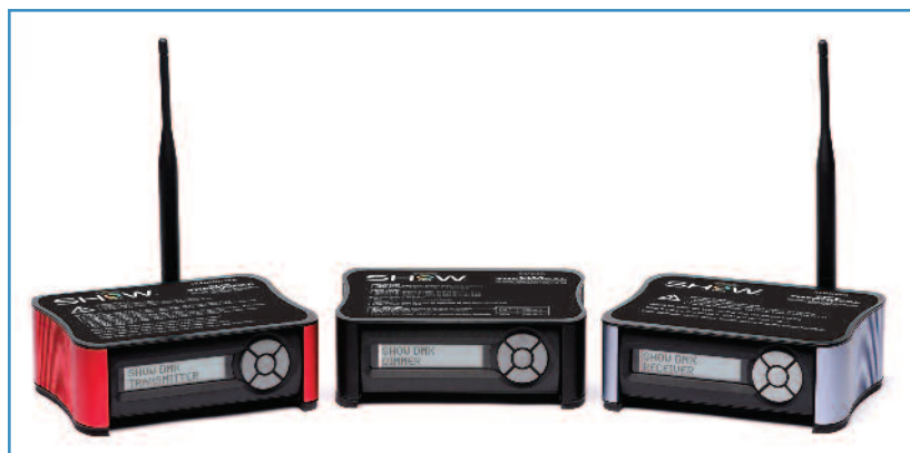
Above: SHoW DMX.

Inside the development of City Theatrical's new, and most controversial, product